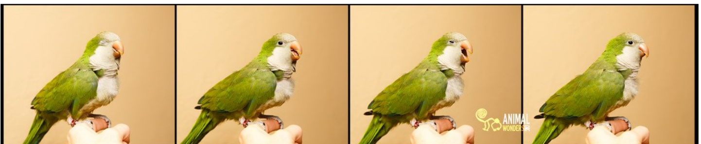
Chopsticks: Quaker Parrots or Monk Parakeets ( Myiopsitta monachus ) are social birds native to South America.