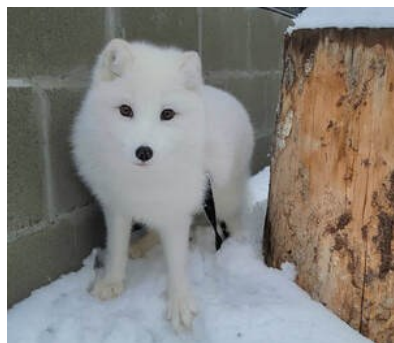
Lumi, the Arctic Fox

presentation followed by a 30-minute interactive session.