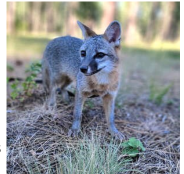
Atlas, the Grey Fox

Animal Wonders is brought to you by the generosity of the NVPL Foundation and Rapp grant.