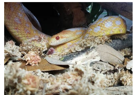
Starburst, the Gopher Snake